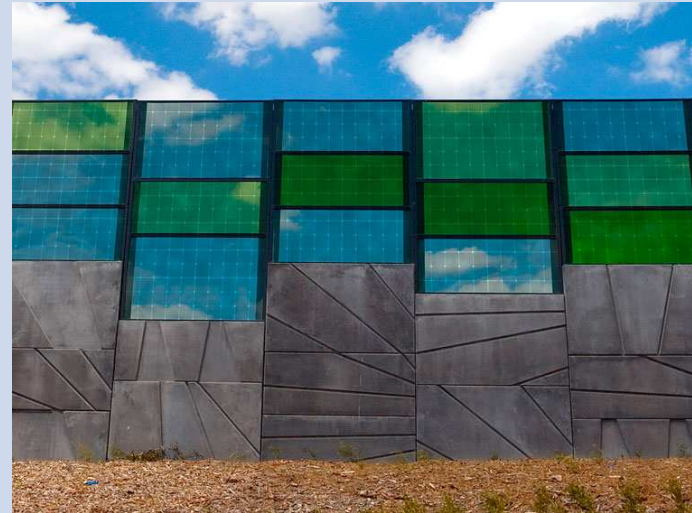
Bi-facial PV cells in a noise wall application