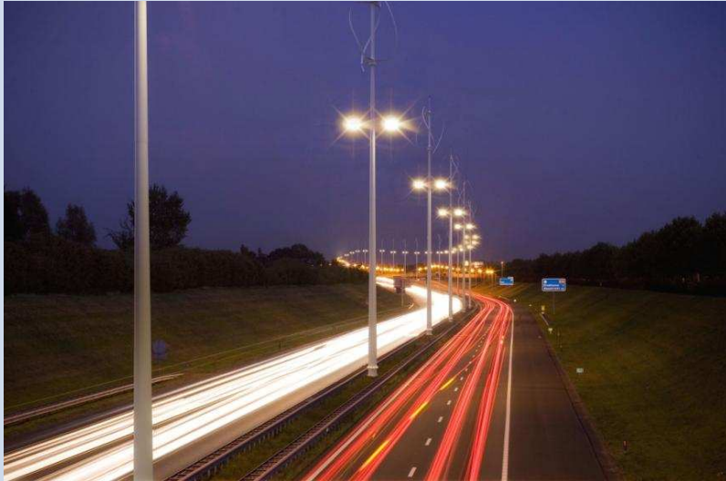
Combination Vertical Axis Wind Turbine (VAWT) & LED Lighting towers